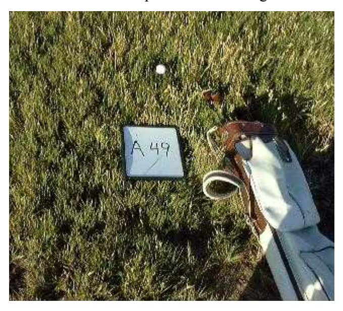
Turf characteristics that are important to include in saltgrass selections include genetic color, density, and mowing quality.

However, we do lack a clear understanding of the influence of environment on flowering. There have been reports that burning of fields