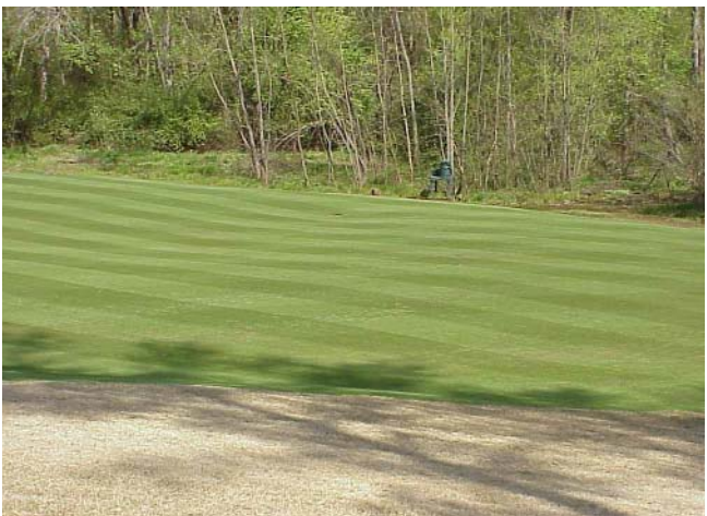
Modeling pesticide runoff can be useful in evaluating the potential for chemicals to migrate to surrounding surface waters from sites of application such as golf course fairways.

Pollution of surface waters from pesticide runoff can be a result of significant rainfall occurring soon (e.g., less than 24 hours) after the chemical application. Successful turf managers are always cognizant of current and forecasted weather conditions, so in well-managed turf, this may rarely occur. This limits our ability to draw con-