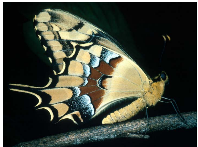
Field and laboratory research indicated that the two principal factors contributing to the demise of the Schaus Swallowtail throughout much of its former range were habitat loss and mosquito control adulticide spraying.

The bulk of the captive propagation work was carried out at the University of Florida, where the Boender/USFWS Endangered Species Laboratory became available in June, 1993 along with screened enclosures and greenhouse support facilities. As a result, the captive holding became the only readily available source for livestock reintroductions and prompted the rapid expansion of existing livestock breeding to become one of the largest endangered invertebrate captive propagation programs in the U.S.