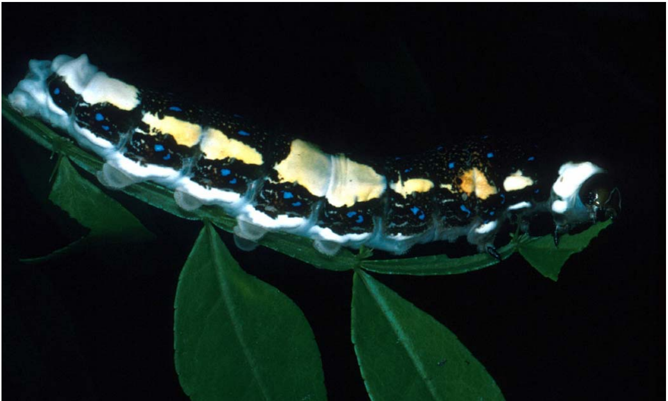
Native larval host plants and adult nectar sources are being planted to create sufficient natural habitat suitable to maintain transient adult butterflies, encourage adult movement and gene flow between existing colonies, and allow for the natural establishment of new breeding colonies within the Keys.

200 miles from the south Florida mainland, as the only viable means of travel to the Keys was via boat, and Key West was a major port. In fact, Key West was the largest city in Florida in 1890, exceeding even Miami in population size. It was not until several years later in 1912 that Henry Flagler built a new railroad through the Keys, linking the mainland to Key West, and opening up the numerous small islands to tourism and colonization. By then the remaining tropical hardwood hammock habitat on Key West had already been cleared for housing and commercial development, and the butterfly was extirpated there while still inhabiting the less settled Keys to the north.