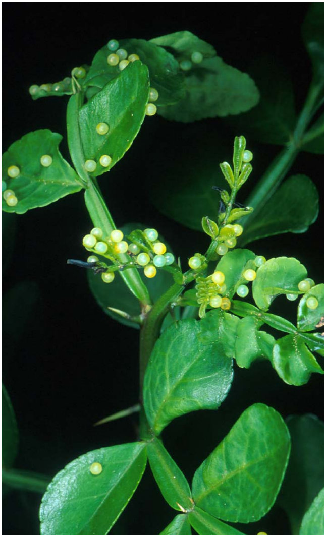
The U.S. Fish and Wildlife Service had given the University of Florida permission to remove 100 eggs in June 1992 as the starter nucleus of a large-scale captive propagation program.

In Spring 1995, the first reintroduction efforts were initiated. A total of 764 pupae were released in 7 sites, from the Deering Estate in south Miami on the mainland to Key Largo.