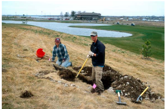
Researchers examined whether burrowing owls would locate and occupy artificial burrows installed on 8 golf courses in south-central Washington (near the cities of Pasco, Kennewick, Richland, and Moses Lake).

Burrowing owls typically nest and forage in short-grass open areas and avoid areas with high density of trees, shrubs, or tall grass (5). The characteristic large, open areas of manicured, short grass on golf courses attracts burrowing owls. Indeed, burrowing owls often are seen foraging and even nesting on golf courses (8). However, burrowing owls generally like to forage close to their nest burrow and golf courses often lack suitable burrows required by owls. Golf courses might be able to aid burrowing owl conservation by providing artificial nesting burrows. Because burrowing owls are still present in many areas throughout the western U.S. (3), effective conservation efforts should be implemented immediately to reverse declining population trends.