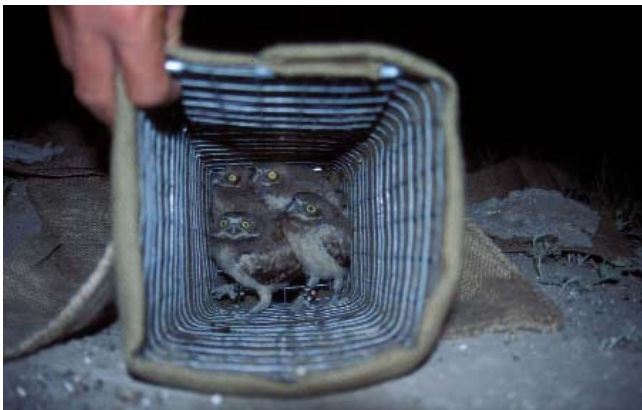
Some golf courses can enhance existing nesting opportunities for burrowing owls, and subsequently may help to reverse local declines of owl populations.

Indeed, nests in artificial burrows tend to have lower depredation than natural burrows (11), and annual site fidelity at golf course burrows was slightly higher than at burrows off golf courses. Conversely, golf course burrows fledged fewer young than burrows off golf courses, and we need to pay close attention to this to ensure that golf courses are not detrimental to owls (i.e., they have features that entice owls to attempt nesting, but contain other features that cause poor success). In