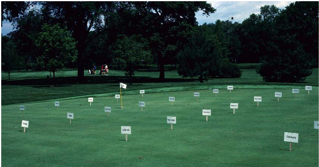
There were significant differences among the cultivars in their ability to restrict Poa annua invasion. The top statistical group of bentgrasses had a range of 3.5% to 7.5% Poa coverage compared to over 20% Poa coverage in the 'Penncross' plots.

But the take home message from this experiment was that there were significant differences among the cultivars in their ability to restrict Poa annua invasion. The top statistical group of bentgrasses had a range of only 3.5% to 7.5% Poa coverage (% area of the plot covered by annual bluegrass). We consider this amount of invasion to be very low given the green's age and location. Furthermore, this number is even more