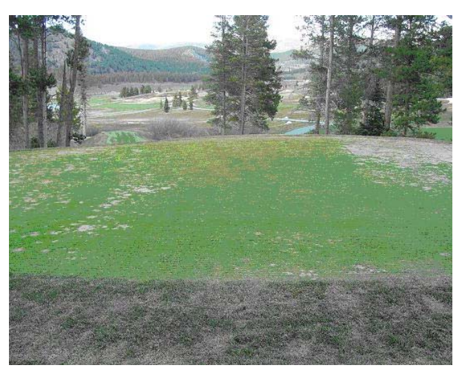
The #5 tee at Breckenridge where the Nordic Track Cross Country Ski Trail compacted the turf in the middle of the tee, reducing damage caused by snow mold. Gray snow mold damage can be seen on the edges of the tee where no compaction occurred.

There is a misconception that snow compaction caused by snowmobiles and skiers increases snow mold severity. We found that snow mold severity was almost non-existent underneath the Nordic/Cross Country ski trails located on the Vail and Breckenridge golf courses. We found that the compaction associated with the trails lowered temperatures at the soil/snow interface, often to temperatures below freezing, and