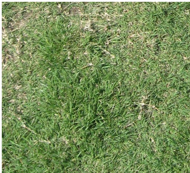
Bermudagrass can be difficult to control as a perennial weed when it contaminates other grass species.

The alternative option for turfgrass renovation utilizes soil sterilants. Until 2005, methyl bromide was commonly used to kill established turf and fumigate the soil prior to replanting (6). However, with the phase-out process of methyl bromide already in motion, alternative soil fumigants have been assessed for their efficacy of disease and weed control (6, 7, 9, 10). Currently, little information is available about using alternative fumigants to eradicate bermudagrass and re-establish zoysiagrass for fairway renovation. Ongoing research at Auburn University is being conducted to evaluate methods for converting bermudagrass fairways to zoysiagrass using various herbicides and soil sterilants.