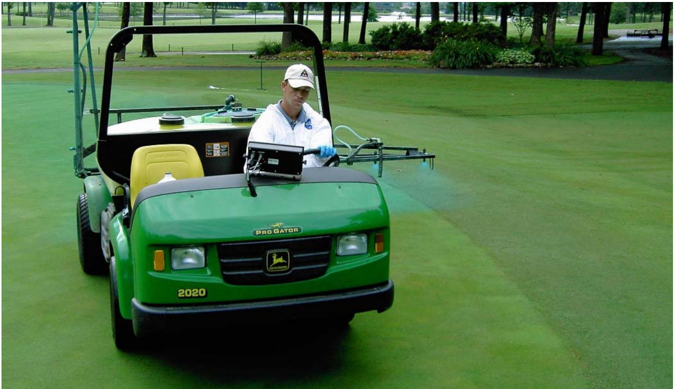
Foliar fertilization, applying small amount of nutrients to the foliage (leaf surface) of putting greens has become a common practice for golf course superintendents.

inch of leaf surface, and what little growth the plant can muster is mown off each day, you can readily see that what these plants lack is enough energy from photosynthesis. The lack of energy is manifested in several ways: root growth is restricted, shoot growth is diminished, and the plant lacks overall vigor. What management practices can be instituted under these conditions to improve plant performance and energy balance?