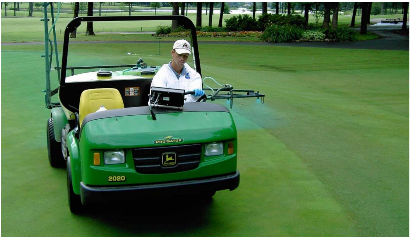
Foliar fertilization, applying small amount of nutrients to the foliage (leaf surface) of putting greens has become a common practice for golf course superintendents.

inch of leaf surface, and what little growth the plant can muster is mown off each day, you can readily see that what these plants lack is enough energy from photosynthesis. The lack of energy is manifested in several ways: root growth is restricted, shoot growth is diminished, and the plant lacks overall vigor. What management practices can be instituted under these conditions to improve plant performance and energy balance?