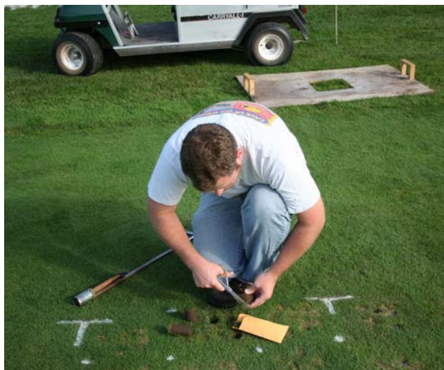
Research at the University of Illinois demonstrates that only about 10% of the foliarly applied ammonium gets absorbed by creeping bentgrass putting greens.

But let's consider a creeping bentgrass putting green mowed daily at 0.125". What limits its growth? The turf manager monitors greens daily, provides water when needed, fertilizes frequently with low doses of nitrogen, phosphorus, potassium, and micronutrients. What can these plants possibly lack? The answer is energy . When a plant is only allowed to have 1/8 of an