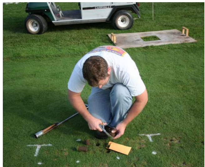
Research at the University of Illinois demonstrates that only about 10% of the foliarly applied ammonium gets absorbed by creeping bentgrass putting greens.

But let's consider a creeping bentgrass putting green mowed daily at 0.125". What limits its growth? The turf manager monitors greens daily, provides water when needed, fertilizes frequently with low doses of nitrogen, phosphorus, potassium, and micronutrients. What can these plants possibly lack? The answer is energy . When a plant is only allowed to have 1/8 of an