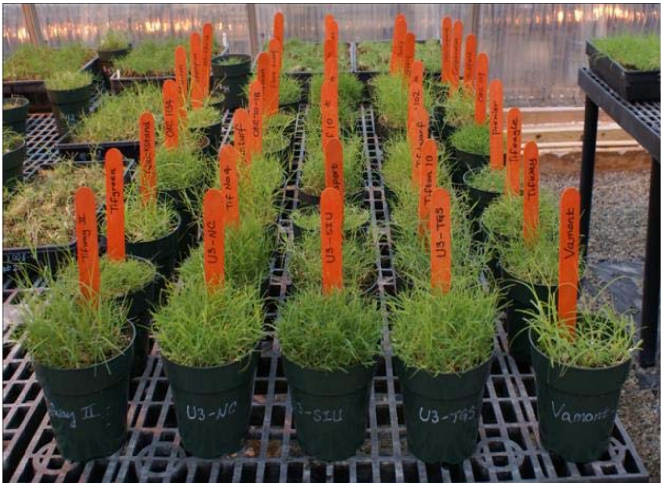
Figure 1. Thirty-two clonal turf bermudagrasses grown in a greenhouse at Oklahoma State University in preparation for SSR marker analysis. Their varietal names are ‘Baby’, ‘Celebration’, ‘FloraTex’, ‘Midfield’, ‘Midlawn’, ‘Midway’, ‘MS-Choice’, ‘MS-Pride’, ‘MS-Express’, OKC-70-18, ‘Latitude 36’ (OKC 1119), ‘Northbridge’ (OKC 1134), ‘Patriot’, ‘Premier’, ‘Quickstand’, ‘Sunturf’, ‘Texturf 10’, ‘Tifton 10’, ‘TifGrand’, U-3-SIU, ‘Vamont’, ‘Midiron’, ‘TifSpor’t, ‘Tifway’, ‘Tifway II’, ‘TifEagle’, ‘Tifgreen’, ‘Champion’, ‘Floradwarf’, ‘Mini Verde’, ‘MS-Supreme’, and ‘Tifdwarf’.

current (2007-2012) National Turfgrass Evaluation Program (NTEP) National Bermudagrass Test ( http://www.ntep.org/bg.htm ).