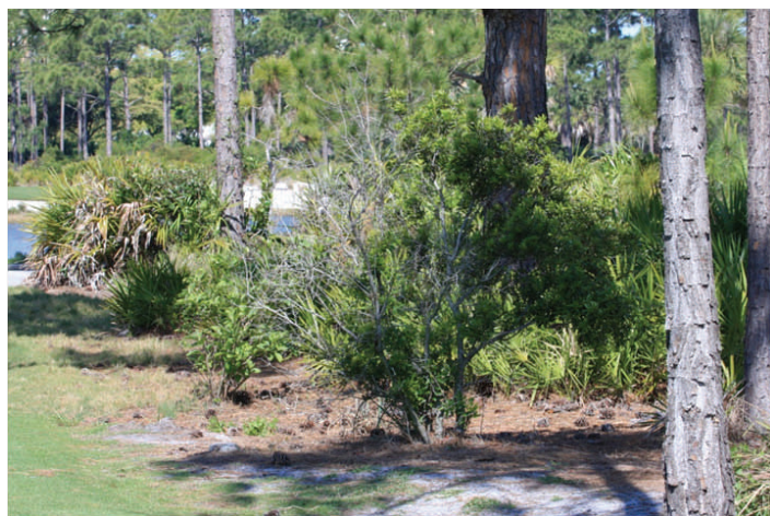
Figure 3. Southern wax myrtle damaged from the salt in spray drift from the irrigation system.

Any plants subject to salt drift or irrigation on or near the course must be halophytic in order to tolerate damage from the salt. Some examples include seashore dropseed ( Sporobolus virginicus ) and sea oxeye daisy ( Borrchia arborescens ). Excessive salts can predispose