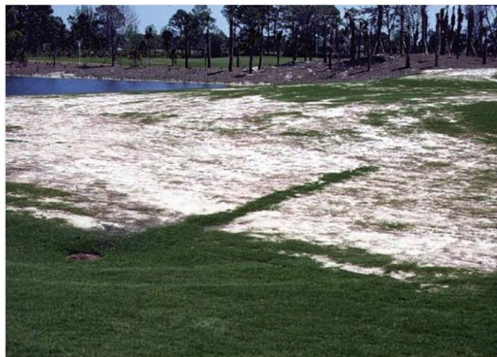
Figure 1. The accumulation of salts in the soil can damage golf course turfgrasses. Note the healthy turf over the drain line.

drainage, and a coarse soil were needed to grow turf. For this golf course, it was brackish water or no water; seashore paspalum or no golf course. In fact, without the development of seashore paspalum and research supported by the USGA, the Old Collier Golf Club would not exist.