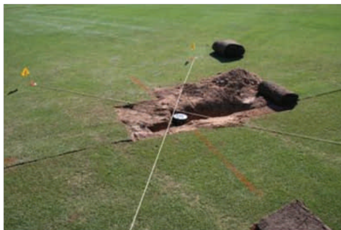
Figure 1. A mini-triangulation system was developed to protect the true location of each sprinkler in the field.

Paradise Valley Country Club in Paradise Valley, AZ, where an irrigation redesign project was undertaken in 2007 (1).