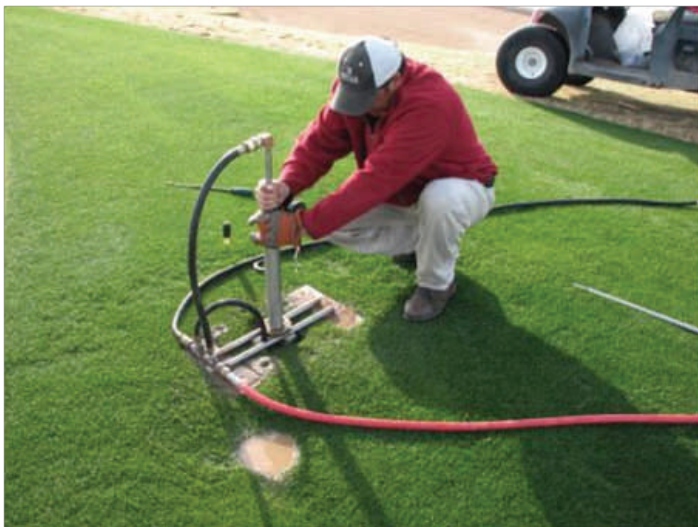
Figure 2. The simple act of raising and leveling

triangulation system was developed to protect the true location of each sprinkler in the field. As a result, DU's above 80% were regularly achieved. The 501 acre feet used (compared to 626 acre feet before the redesign) shattered the club's water use goal. With rising water costs, this savings is significant, and more importantly, they were able to produce quality turf while beating their water allotment.