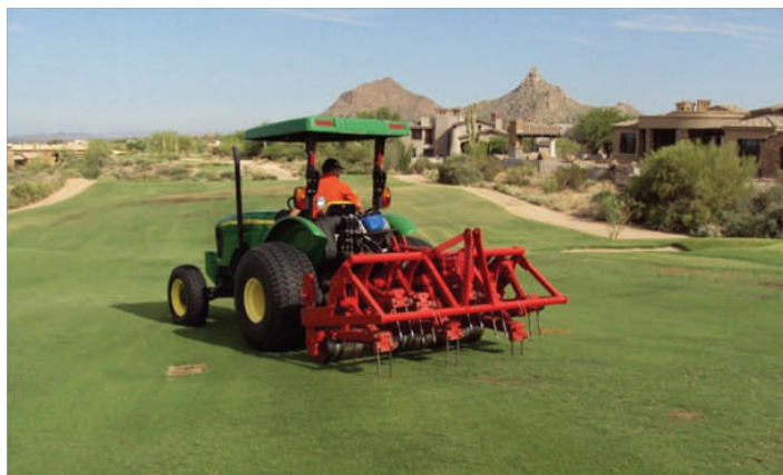
Figure 3. Utilizing soil improvement methods such as with deep tine aeration can reduce runoff and improved soil water infiltration.

Fairway topdressing with sand – On very hard, rocky soils surface runoff may result in water loss and turf managers often respond with more frequent, but light watering. Aggressive sand topdressing (0.5 – 1 inch per year) on challenging soils will improve turf quality, enhance salt leaching and may reduce water consumption. Furthermore, research suggests that sand topdressing can improve surface drainage and reduce surface runoff (4). Experience working with several golf courses committed to aggressive sand topdressing has demonstrated that salinity levels can be reduced by more than 50%, a function of im-