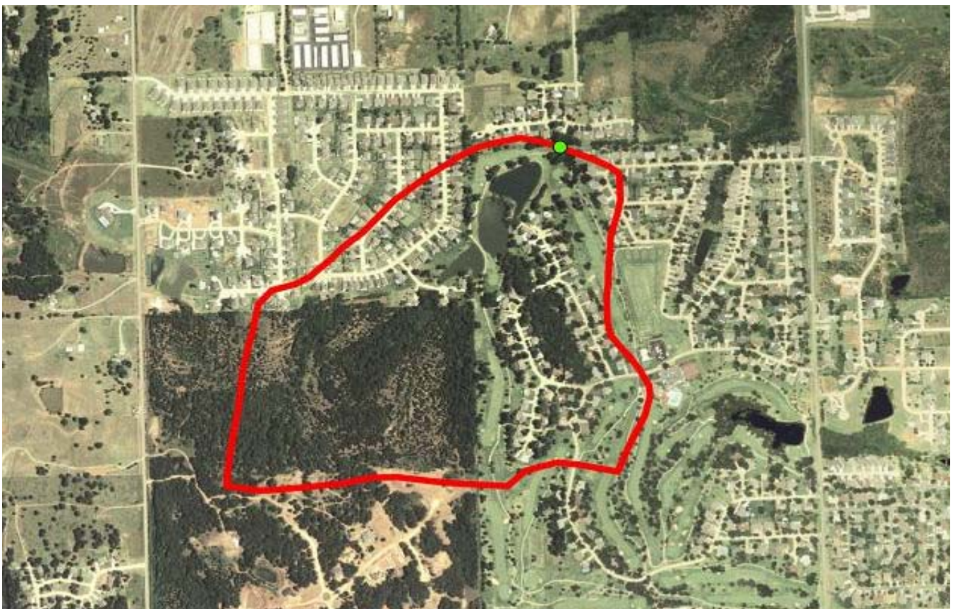
Figure 2. Location of the phosphorus removal structure (green dot) at the outlet of the 150-acre mixed residential and undeveloped watershed (outlined in red) in Stillwater, OK.

After studying many phosphorus-sorbing materials and conducting laboratory and pilot scale experiments, we constructed a P-removal structure on the property of Stillwater Country Club, Stillwater, OK (Superintendent, Jared Wooten). The P-removal structure (Figure 1) was placed at the outlet of a 150-acre suburban watershed (Figure 2) which consisted of approximately 35, 50, and 15% residential, undeveloped, and golf course area, respectively.