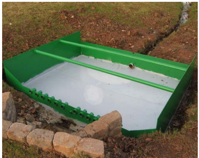
Figure 1. The uncompleted phosphorus removal structure shown during construction.

There are two main forms of P, particulate P and dissolved P, which are transported to surface waters via surface runoff and subsurface flow. Particulate P is that which is sorbed onto soil particles. It is not 100% available after it reaches a water body. Controlling erosion eliminates particulate P transport. Dissolved P is 100% bio-available upon reaching a water body and erosion control does little for reducing its movement. Controlling dissolved P losses from suburban and urban landscapes is especially challenging when soil P accumulates due to several years of P fertilization beyond plant needs. Even after cessation of P fertilization and implementation of traditional best management practices, dissolved P will continue to “leak out” of high P soils for many years.