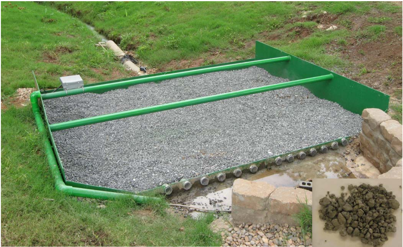
Figure 3. The completed phosphorus removal structure filled with steel slag, a by-product of the steel production industry. Close up of steel slag is shown in lower-right inset.

Two irrigated golf greens were located within 300 to 400 ft. from the structure. The greens were regularly irrigated as necessary, and this irrigation sometimes produced runoff that reached the structure. The structure was located in a drainage ditch immediately on the downstream side of a drainage culvert (Figure 3) where all water exited the watershed via a concrete trapezoidal bar ditch maintained by the City of Stillwater. The bar ditch drained directly into Stillwater Creek. Some runoff entered the structure by flowing along the side of the culvert into the structure inlet. Runoff entered the structure through several 2-inch diameter pipes connected to buried perforated pipe for evenly distributing the water throughout the phosphorus-sorbing materials. The water could then infiltrate through the bed of PSMs and drain out through the 4-inch diameter outlet.