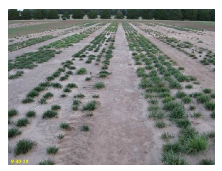
Figure 2. Evaluation nursery containing small plots derived from hybrid bluegrass listed in Table 1 and additional selections.