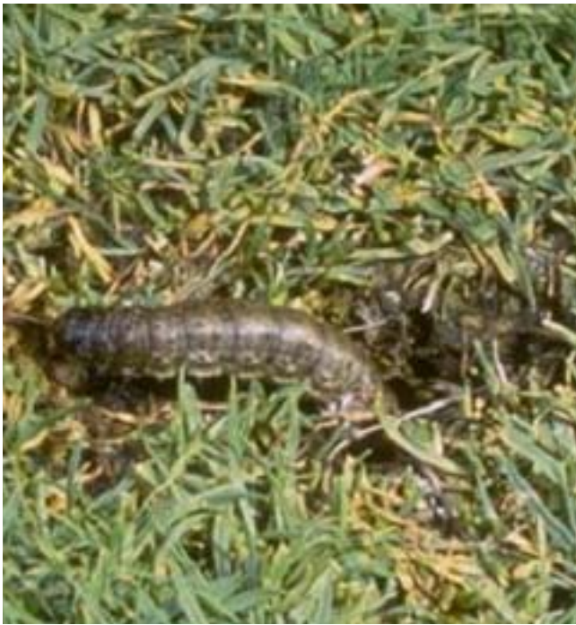
The BCW larvae make burrows in the thatch or soil, or occupy aeration holes or other cavities, emerging at night to chew down grass blades and stems around the burrow.

courses. We were collecting large numbers of BCW from six Kentucky golf courses to survey for parasitic insects, but our study was thwarted when <75% of the field-collected larvae died from a pathogen infection. Diseased larvae showed necrotic spots covering the integument (skin) followed by a swollen, milky white appearance. Death by liquefaction occurred within a few days.