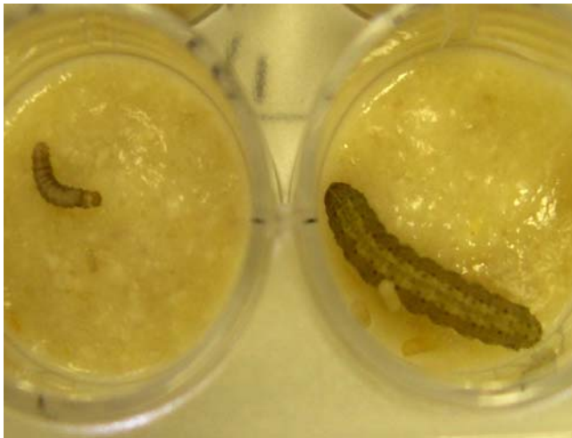
When young larvae become infected, their growth and development are stunted and they die while still small.