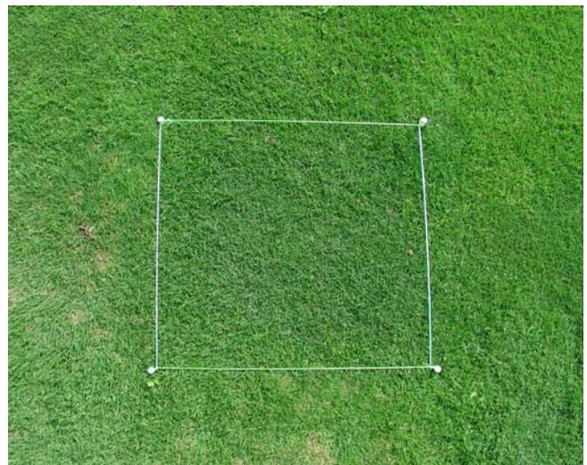
One of the final creeping bentgrass plants selected for resistance to snow mold and dollar spot, combined with excellent turf quality, compared to neighboring plants highly susceptible to dollar spot at Verona, WI in August 2005

Three populations of creeping bentgrass clones were developed for this study. The Wisconsin population consists of a cross between