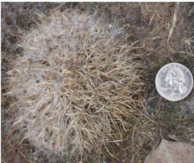
A creeping bentgrass clone highly susceptible to speckled snow mold in April 2004

Inoculations with pink snow mold, Pythium blight, and black cutworm failed to provide meaningful differences among the creeping bentgrass clones. In the case of Pythium blight, the disease pressure was so severe and uniform that all plants were heavily or completely damaged. All creeping bentgrass clones in the study were highly susceptible under the extreme conditions of this inoculation. For pink snow mold, the relatively few minor symptoms were due to mild winters with little significant snow cover. For black cutworm, the lack of variation among creeping bentgrass clones could only be attributed to extreme variation in the inoculation technique and/or the measurement of symptoms. Apparent differences among clones were not repeatable, indicating that there are environmental and/or cultural factors that obscure genetic differences among clones.