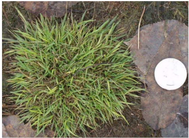
A creeping bentgrass clone highly resistant to speckled snow mold in April 2004

Variation among clones within populations was significant for all measures of snow molds (Table 1) and dollar spot reaction (Table 2). There was a large range among clones for all variables, generally consisting of at least 75% of the scale of measurement. LSD values were all small relative to the range among clone means. Repeatability was moderate to high for all dollar spot and snow mold ratings. These results demonstrated that there are large and consistent differences among clones for both dollar spot and snow mold reaction.