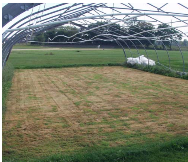
The above image shows the "chamber of death" and damage on creeping bentgrass clones due to inoculation with Pythium disease in August 2005.

Genetic resistance to disease pests is a