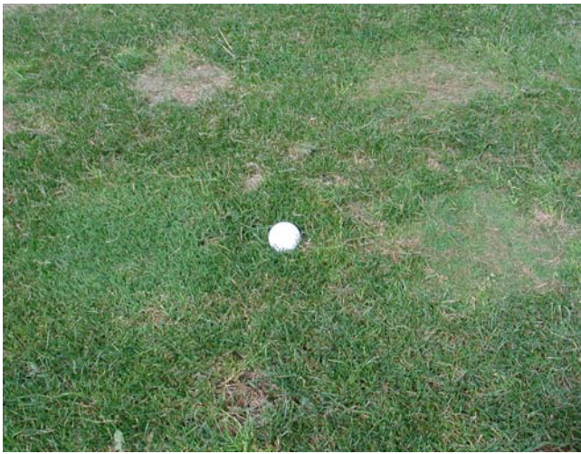
Four creeping bentgrass clones in a ryegrass fairway at Gateway Golf Club, showing differences in genetic resistance to dollar spot in August 2005

widespread phenomenon in agricultural and horticultural plants. Disease resistance, identified and developed by plant breeders and plant pathologists, has been used to protect economically important plants for more than 90 years. There are many examples in which genetic resistance has been durable for over 30 years without any need for fungicidal protection or increase in disease incidence.