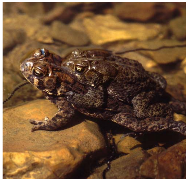
The important point for conservation is that if most populations cannot replace dying adults with new offspring at a rate equal to those dying, the population could go extinct.

It is evident from several independent studies that individual amphibians have an upper limit of approximately 1,000 - 1,200 meters to how far they can travel overland (4, 26). Assuming this is true for all amphibians, it suggests that populations (pond-patches) that make up a metapopulation need to be within this distance. If we look at the distance between wetlands in a natural landscape like the South Carolina coastal plain, we find an average inter-wetland distance of 471 m (47). If wetlands are filled or drained and the density goes down, the average inter-wetland distance goes up. Thus, ponds or