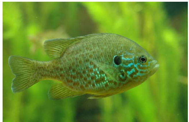
Eliminating fish from ponds is a critical step because ponds without fish allow for greater abundance of amphibians and more diverse communities.

We have only recently begun to discover where and how far amphibians go after breeding and what habitats are important for their survival and for persistence of the population. Ponds are often used for breeding by a single population. They are faithful to that pond, and migrate to and from the pond each breeding season. They also appear to be faithful to the terrestrial habitat surrounding ponds. We know that individuals migrate in and out of the pond in the same place each year and that they travel several hundred meters away from ponds into the forest (142 - 289 m; 462 - 939 feet; estimates for 32 species from Semlitsch and Bodie, 47), or fields depending on species preference. This distance varies among species with salamanders traveling less than frogs and toads, and toads traveling farther, especially western U.S. species traveling as much as 1,000