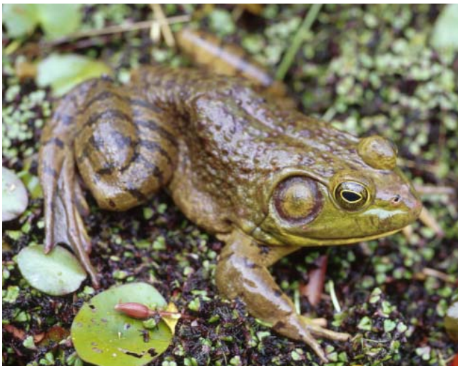
The negative effect of bullfrogs has been associated with amphibian declines especially in areas where they have been introduced.

The timing of pond drying to reduce predators and competitors is also important and should mimic the natural cycle, or hydroperiod, of filling and drying. Premature drying ponds in the spring or early summer will reduce the number of amphibian species with longer larval periods, like salamanders and newts, so for this reason should be avoided. Drying ponds for short periods or biannually in the late summer or fall will be adequate to exclude fish predators, reduce the number of insect predators, and reduce populations of bullfrogs that can negatively impact amphibian communities. Further, pond drying also promotes the natural oxidation of sediments and release of