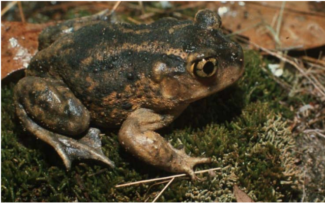
Spadefoot toads are often associated with temporary wetlands located in grasslands.

meters. We also have evidence to show that females of some species like gray treefrogs and boreal toads travel farther than males (38).