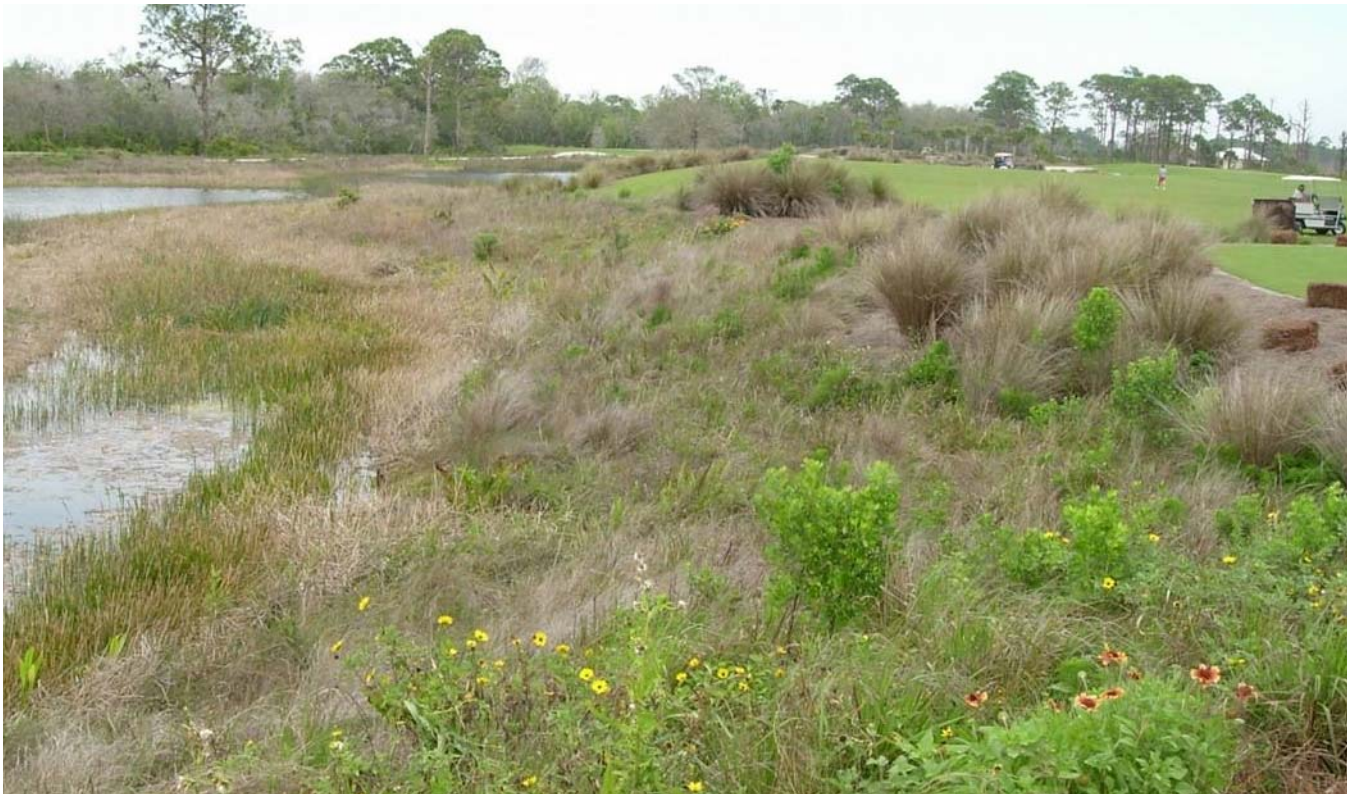
Restricted practices should include "no mow, no spray" 25-foot-wide buffers adjacent to all core habitats including uplands, followed by another 25-foot-wide buffer where organic fertilizers only are allowed.

Best management practices on the golf course are not relegated only to construction but are best integrated into course design and implemented during construction and long-term management. Combining BMP and "integrated pest management" (IPM) programs together with efficiency in rate and timing of fertilizer application and irrigation will substantially reduce or eliminate water quality problems (32, 33) which directly impact aquatic amphibian breeding sites. Tenets of IPM programs include the use of resistant turf varieties, cultural and biological control of pests, and good nutrient management techniques (29). In addition, effective management of the maintenance area is an important part of water quality management. The general approach is to isolate all potential contaminants from soil and water, not to discharge any material onto the ground or into surface water bodies, and to minimize irrigation,