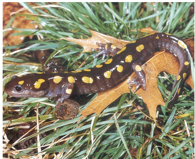
Some amphibian species such as the spotted salamander shown above are associated with forests.

Managing healthy populations requires that each component of the food web remains functional. The way both the aquatic and terrestrial environments are managed is key to the type of amphibian community that can be supported. Amphibian communities are distinguished to some extent by the types of pond communities they use: forest or grassland. The surrounding landscape will influence the amount of light a pond receives, how productive the pond is in terms of food resources (such as algae, the food base of the community), the temperature of the water, and the length of time the pond holds water.