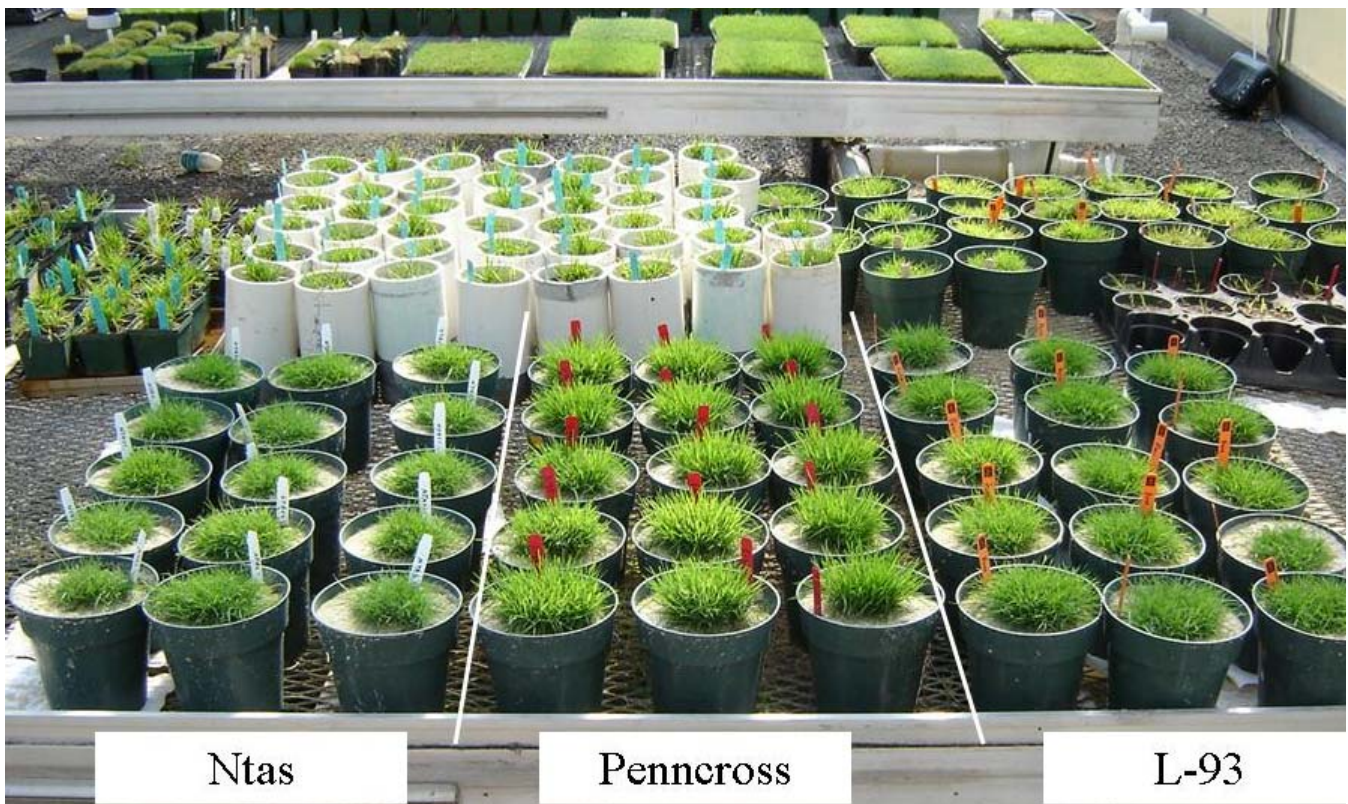
Researchers at Rutgers University are comparing tolerance to high temperature between thermal A. scabra , adapted to warm soils in geothermal areas in Yellowstone National Park and creeping bentgrass. The overall goal of the project was to identify physiological and metabolic mechanisms controlling heat tolerance in cool-season turfgrass species, specifically bentgrass.

We performed a correlation analysis between hormone accumulation and leaf senescence to determine whether changes in hormone production during heat stress are associated with heat-induced leaf senescence and to see which hormone is more important in controlling leaf senescence. The results suggested that endogenous ethylene and ABA production was negatively correlated and cytokinin production was positively correlated with turf performance under heat stress.