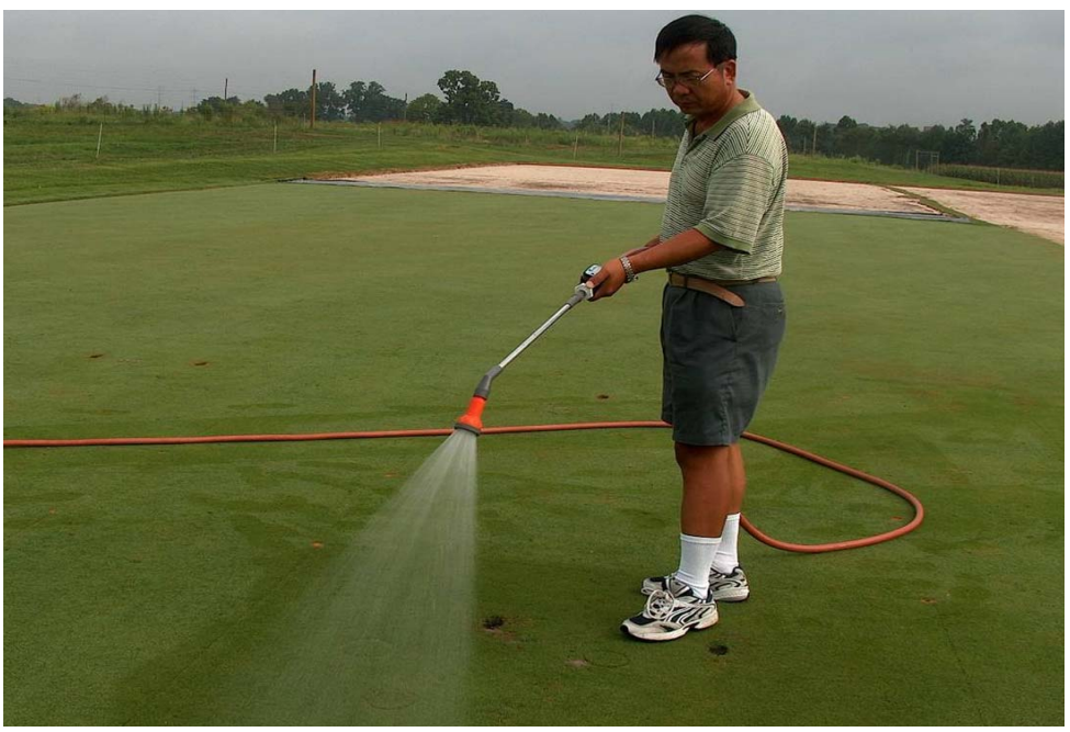
Research was conducted at the University of Maryland to investigate carbon metabolic responses to deep and infrequent versus light and frequent irrigation in 'Providence' creeping bentgrass ( Agrostis stolonifera L). Irrigating creeping bentgrass at wilt, rather than daily to maintain moist soil, generally resulted in higher carbohydrate levels in leaves and roots, which may enable creeping bentgrass to better tolerate and recover from drought and other stresses.