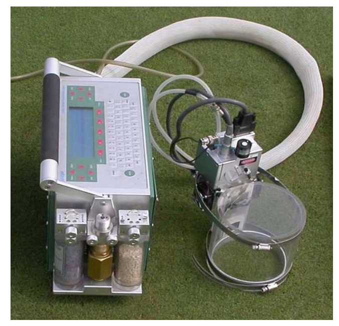
Canopy net photosynthesis (Pn) and whole respiration (Rw) including plant and soil microbe respiration were measured on 2-to 3-week intervals using a portable gas exchange system.

Carbohydrate metabolism in leaves and sheaths, including photosynthesis, respiration, and carbon translocation are major physiological processes that form the basis of healthy plant function. Creeping bentgrass summer performance may be improved by maximizing carbohydrate production through photosynthesis, while