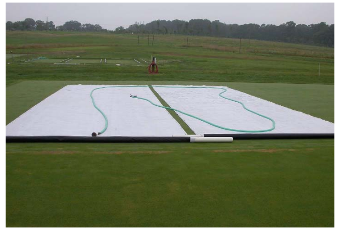
To minimize the impact of rain, two tarps were used to cover all eight plots prior to the onset of rain between May 22 and August 31, 2006 and 2007, however, some rain events occurred before plots could be covered. On those days, light infrequent-irrigated plots were not irrigated.

Maintenance of a favorable water status is essential for plants adapted to conditions with limited water availability. Osmotic adjustment is an