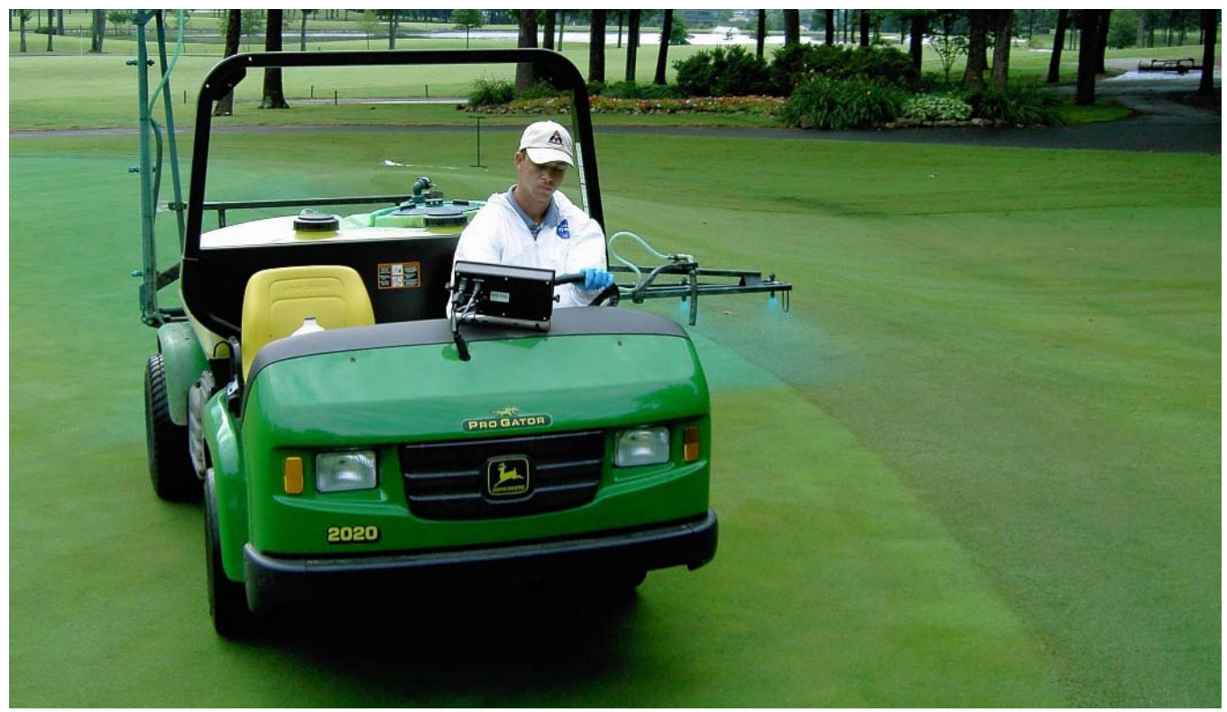
Foliar fertilization, applying small amount of nutrients to the foliage (leaf surface) of putting greens has become a common practice for golf course superintendents.

inch of leaf surface, and what little growth the plant can muster is mown off each day, you can readily see that what these plants lack is enough energy from photosynthesis. The lack of energy is manifested in several ways: root growth is restricted, shoot growth is diminished, and the plant lacks overall vigor. What management practices can be instituted under these conditions to improve plant performance and energy balance?