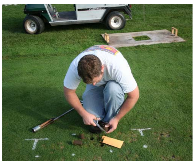
Research at the University of Illinois demonstrates that only about 10% of the foliarly applied ammonium gets absorbed by creeping bentgrass putting greens.

But let's consider a creeping bentgrass putting green mowed daily at 0.125". What limits its growth? The turf manager monitors greens daily, provides water whene needed, fertilizes frequently with low doses of nitrogen, phosphorus, potassium, and micronutrients. What can these plants possibly lack? The answer is energy . When a plant is only allowed to have 1/8 of an