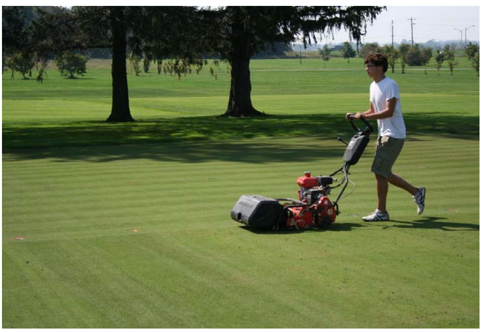
Although foliar feeding is a common practice among golf course superintendents, research at the University of Illinois shows that the uptake of foliarly applied nitrogen is an inefficient process for creeping bentgrass putting greens.