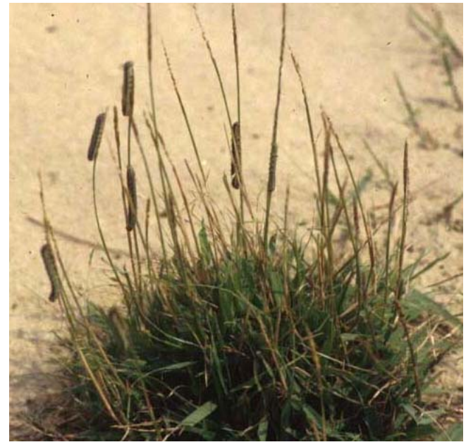
Fall armyworms move across a turfgrass planting consuming all of the green tissue as the go.

Only a few turfgrass cultivars have been developed for their resistance to the major turfgrass pests. Reinert et al. provided a summary of resistance to insects and mites in turfgrasses (31). The limited information on host response to insects and mites in the turfgrass ecosystem suggest greater emphasis is warranted. Host-resistant cultivars, however, have been used successfully as a means of insect control. 'Floratam', a St. Augustinegrass [Stenotaphrum] secundatum (Walt) Kuntze] cultivar, was released and widely planted throughout the southern United States for its resistance to the southern chinch bug (Blissus insularis Barber) (7, 27). Additionally, 'FLoraTeX' bermudagrass was released for its resistance to the bermudagrass mite (Eriophyes cynodoniensis Sayed) and several other abiotic stresses (7).