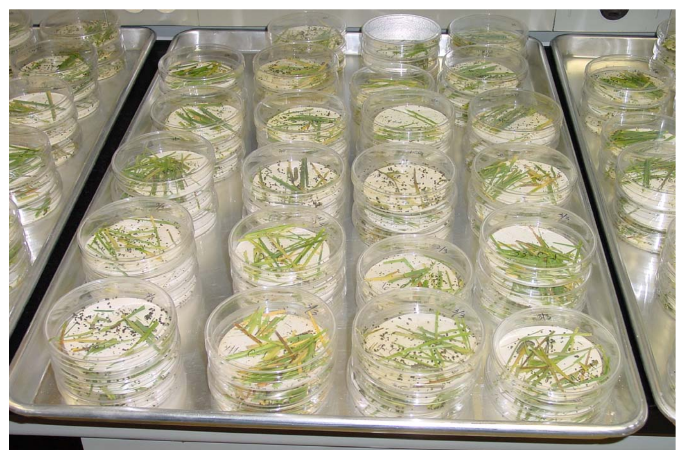
Two experiments were set up in the laboratory using 9-cm diameter x 20-mm deep plastic Petri dishes as larvae feeding chambers. Two 7.5-cm diameter filter paper discs saturated with water were placed in each dish before a small amount of fresh leaf tissue (approximately 3 g) of the respective zoysiagrass genotype was added.

The purpose of our research was to evaluate several genotypes and cultivars of zoysiagrass and to identify potential resistance to the fall armyworm, which is one of the primary pests of turfgrasses across the South and much of the eastern and midwestern U.S.