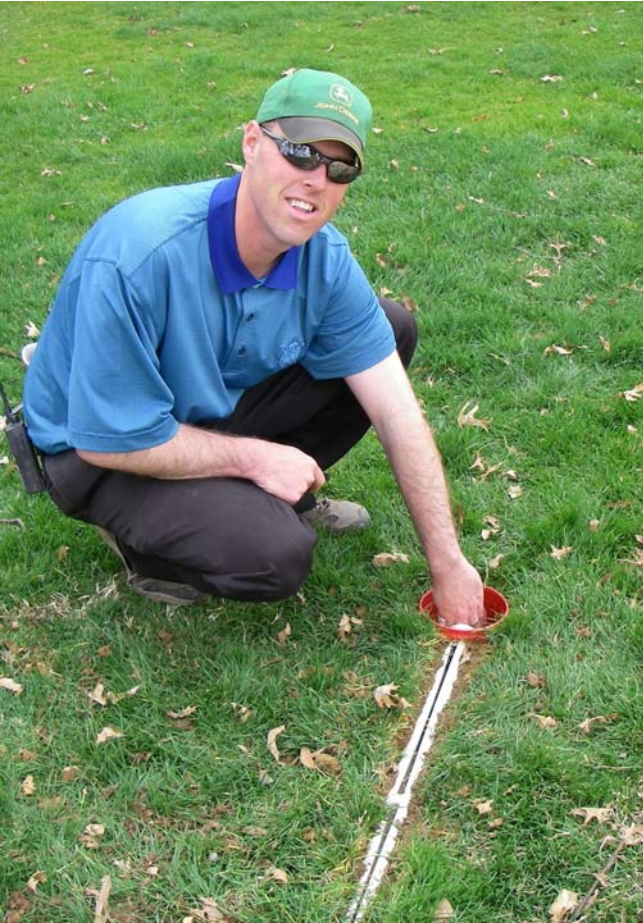
Several hundred billbug adult and larval specimens were collected from Indiana and Idaho using linear pitfall traps (shown above).

and rhizomes of cool- and warm-season turfgrasses. The continuously expanding ranges of several billbug species, possibly driven by increasing interstate movement of turfgrass sod or changes in climatic conditions, have resulted in novel species interactions and a nation-wide collage of billbug species assemblages that has made satisfactory management difficult to achieve in many regions. Unfortunately, most of our current knowledge about billbug biology is based on a relatively small number of scattered studies that provide essential biological information about a few species, but an incomplete picture of the life cycles of these insects (3, 4, 5).