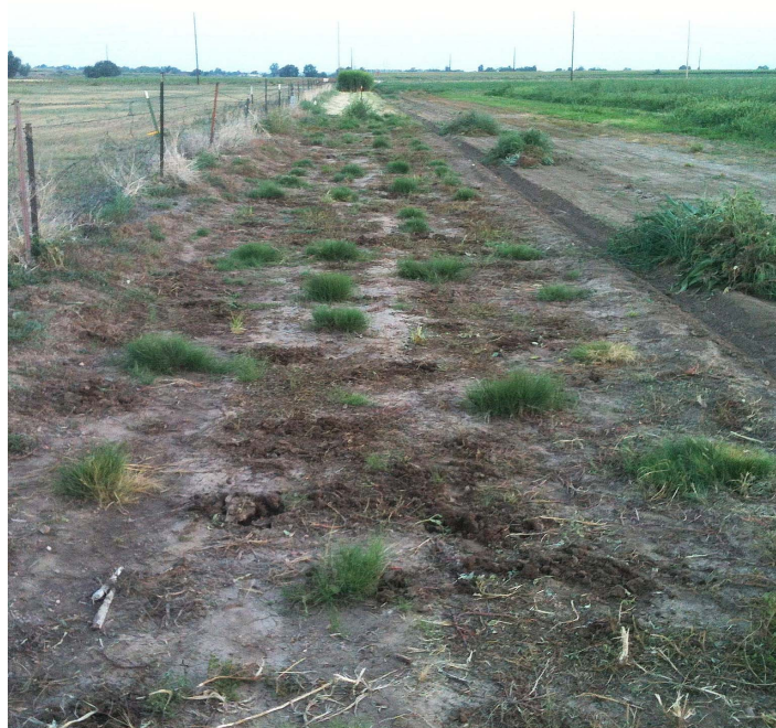
Figure 1. 2010 inland saltgrass polycross nursery of promising parents.

The second generation nursery (Cycle 2) was planted in 2005–2006. The selection and evaluation process of the second generation nursery resulted in a polycross block planted in 2010. This polycross block contains the most promising turf-type saltgrass cultivars developed by us to this point in time (17 females, 11 males). Seed was harvested from this polycross block in September 2012 (this is third generation seed). This seed will be planted in the field in spring 2013 to allow us to conduct