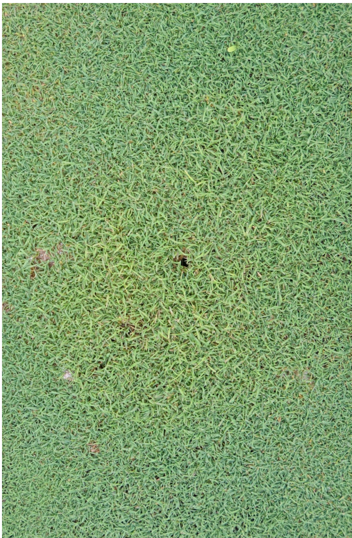
Figure 2. An Acidovorax avenae inoculated bentgrass plot encouraged uniform etiolation. Out of all of the biostimulants tested, Astron typically had the most etiolation.

A field study was initiated in 2011 to determine the influence of biostimulants and plant growth regulators. The trial was arranged in a factorial design with 5 biostimulant treatments (Knife Plus, CytoGro, Astron, Nitrozyme, and Untreated) applied alone and in combination with weekly or biweekly applications of trinexapac-ethyl (0.125 fl oz 1000 ft -2 ). Biostimulants showed no effect on etiolation during the fall of 2011 when etiolation developed naturally. Trinexapac-ethyl reduced etiolation regardless of application frequency, however, biweekly applications tended to break down by the end of the 2-week period.