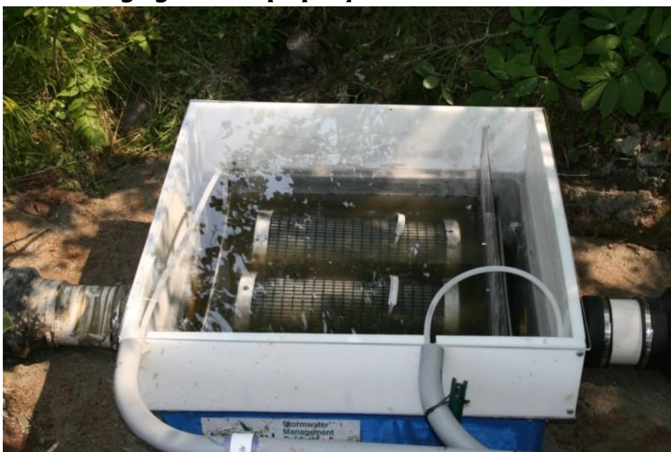
Figure 1. The filter cartridges located on the east drain of Northland Country Club are being evaluated for filtering phosphorus from leaving a golf course property.

6712 automated samplers and programmed to collect discrete flow proportional samples.