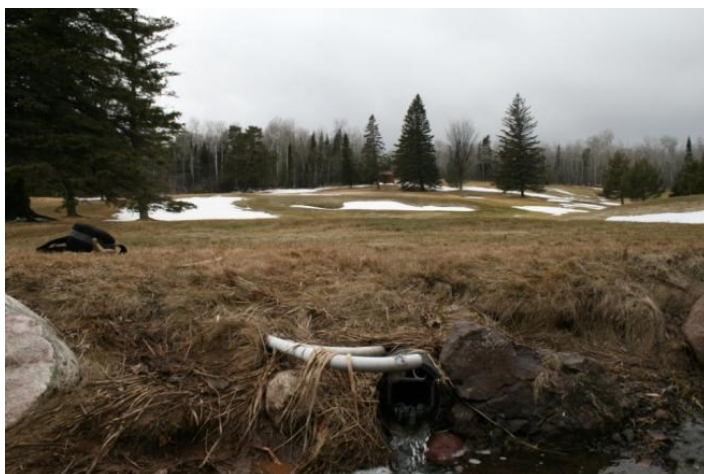
Figure 3. Compound weirs in the outlet of the west (control) and east (treatment) drainage lines at Northland Country Club.

Data collected in 2013 will help to confirm these findings and should provide much needed information on practices that can be implemented to address offsite nutrient transport.