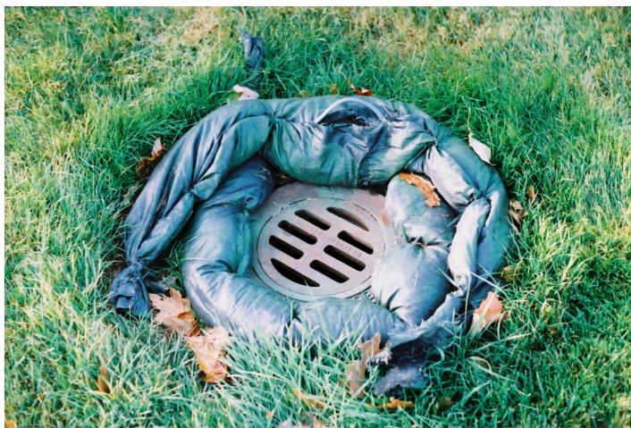
Figure 2. Filter socks were installed around each inlet within the eastern drainage area. The filter socks were filled with 75% steel slag, 2.5% cement kiln dust (CKD), and 22.5% silica sand by volume.

before–after analysis of concentrations and a before–after, control–impact (BACI) design to assess the effectiveness of the cartridge filter on phosphorus loading. In the BACI approach, a relationship was developed between the east and west drain during the before or control period (2004–2008). Following implementation (after period) a similar relationship was developed and compared to the relationship developed for the before period to determine the impact of the cartridge system.