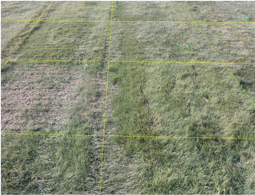
Figure 3. Demonstration of buffalograss shade trial to a group of participants of the 2013 University of Nebraska Turfgrass Research Field day (shade covers removed).