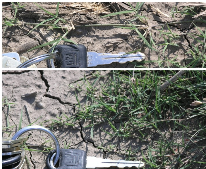
Figure 1. Difference in stolon internode length between a traditional turf type buffalograss (top) and an experimental line selected for canopy density and shorter internode length (bottom).

three year study when grown in dense shade. During the summer of 2013 a shade study was established with seeded and vegetative cultivars, top performing individuals from the previous shade study, individuals used in the 2013 crossing block, and other shade tolerant species for comparison (Figure 3). Results from these studies demonstrate that buffalograss may be improved for wear and shade stress.