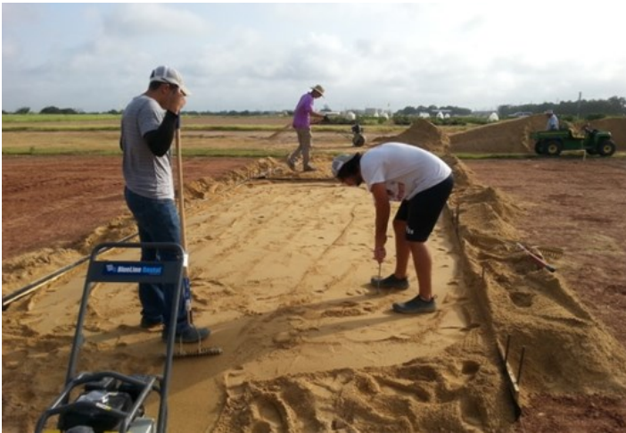
Figure 2. Construction of sandcap treatments for the project.