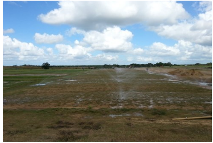
Figure 4. Initial establishment of the sandcapping research site. The subsoil was graded to provide a uniform 2% turtleback up through the center of the site facilitating subsoil drainage of excess water to the edge.

movement of water between plots. On September 2, the study site was hand-sprigged with Tifway bermudagrass at 45 bushels per 1000 sq. ft., heavily topdressed, and rolled. During the initial 6 weeks of establishment, plots received bi-weekly applications of a 17-17-17 plus micronutrients to encourage establishment of plots. One month after sprigging, volumetric water content at the 0 to 2" depth was determined at multiple points along the slope in each plot. Percent establishment was quantified both visually as well as through light box imaging (Figure 1). Initial data indicate the more rapid establishment is occurring within shallower sandcap depths, likely due higher volumetric water content and less intermittent drying at the soil surface.