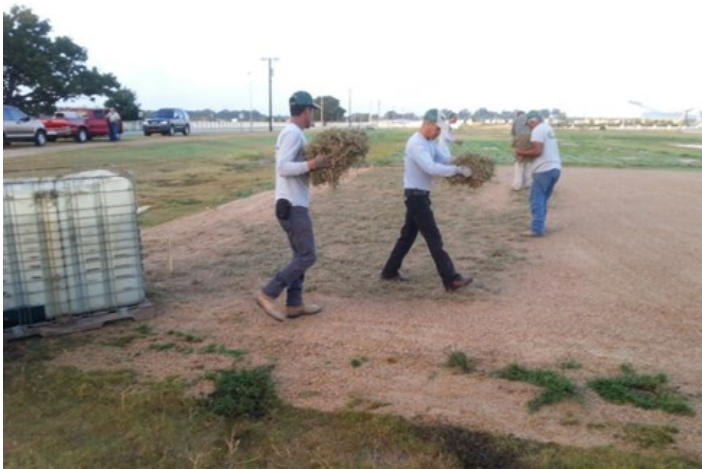
Figure 3. Hand sprigging of sandcapped plots with Tifway bermudagrass on September 2, 2014

movement of water between plots. On September 2, the study site was hand-sprigged with Tifway bermudagrass at 45 bushels per 1000 sq. ft., heavily topdressed, and rolled. During the initial 6 weeks of establishment, plots received bi-weekly applications of a 17-17-17 plus micronutrients to encourage establishment of plots. One month after sprigging, volumetric water content at the 0 to 2" depth was determined at multiple points along the slope in each plot. Percent establishment was quantified both visually as well as through light box imaging (Figure 1). Initial data indicate the more rapid establishment is occurring within shallower sandcap depths, likely due higher volumetric water content and less intermittent drying at the soil surface.