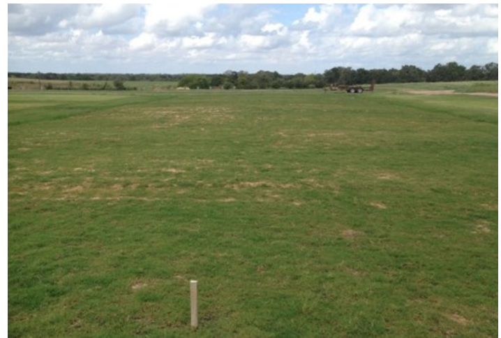
Figure 5. Recent image of the research site, taken in early October, 2014. Plots have attained between 60 to 80% coverage as of the time of this report.